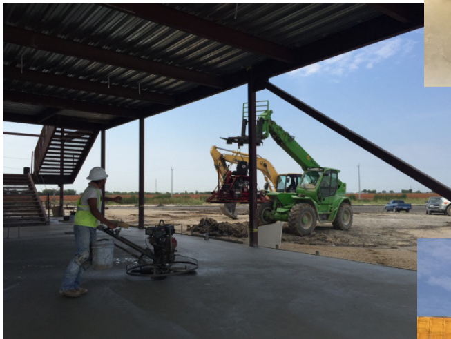
SW MS – First Floor Concrete Pour at Area A