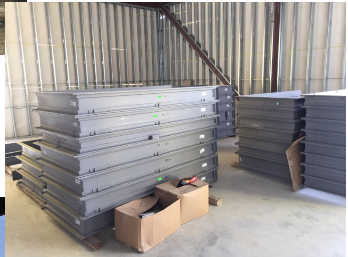
SW MS – Material Storage – H.M. Frames.