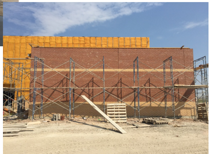
SW MS – Brick Work - Area E