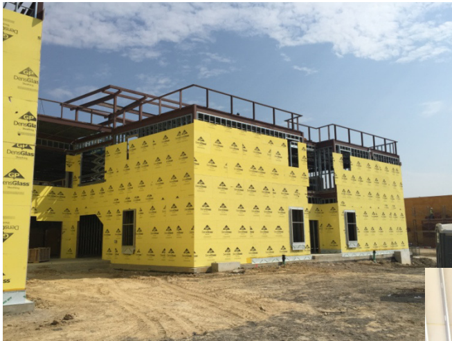
SW MS – Ext. Sheathing/Window work at Area C.