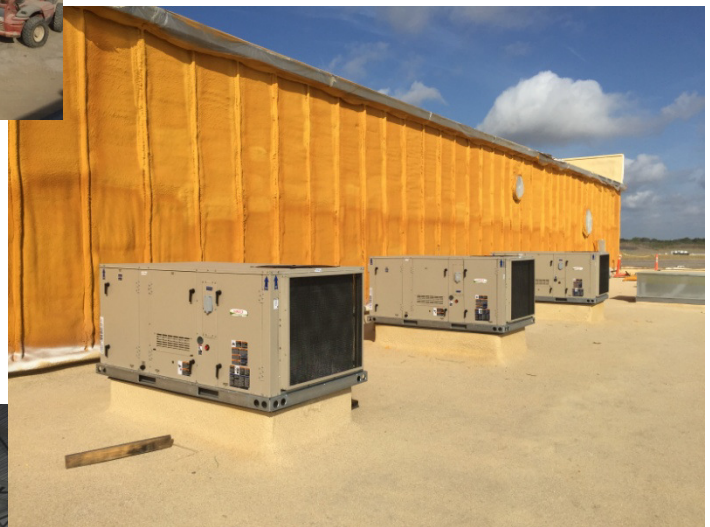
SW MS – AC Unit Installation at Area F Roof.