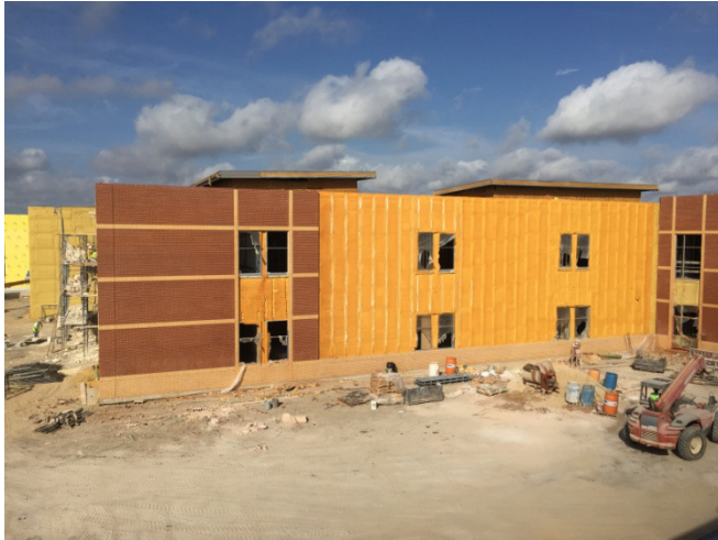
SW MS – Ext. Brick/Insulation work at Area C.