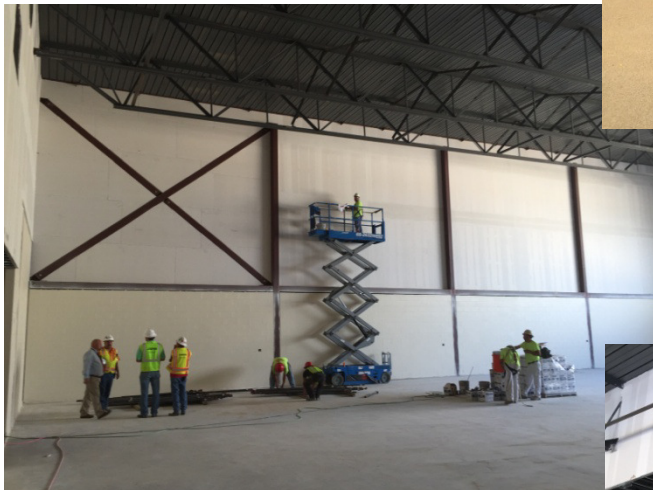
SW MS – Interior Work at Competition Gym - Area F