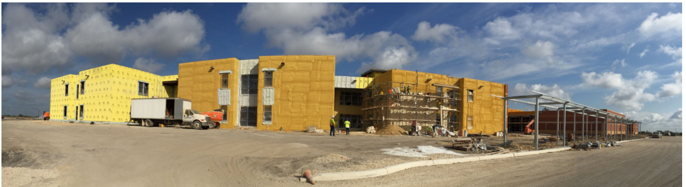
SW MS – Exterior Insulation/Brick Masonry Installation – View towards Areas A, B & C